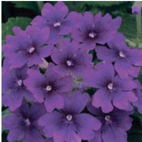
Verbena "Dark Purple"

Diascia is from the snapdragon family. Diascia is frost sensitive, so make sure that you harden off your plants and listen to the weather forecasts.