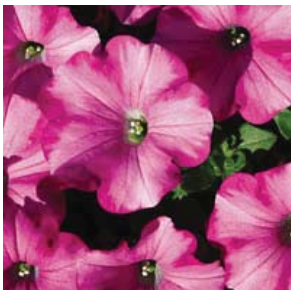
Supertunia "Raspberry Blast"

This supertunia is my personal favorite. I love the way the dark violet purple is framed by the lilac border. It just pops in any container.