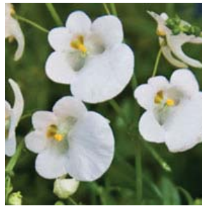
Diascia "Genta White"