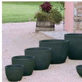
Molded Pots from Italy

This two-toned petunia is a traffic stopper in the greenhouses. It is easy to care for and will tumble attractively over any container.