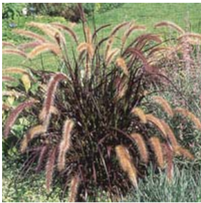
Fountain Grass "Rubrum"

The key to success is remembering to feed your containers regularly. I add SmartCote to all my containers in the spring and then fertilize weekly with Plant Prod's 15-30-15. A hose end fertilizer applicator makes it easy.